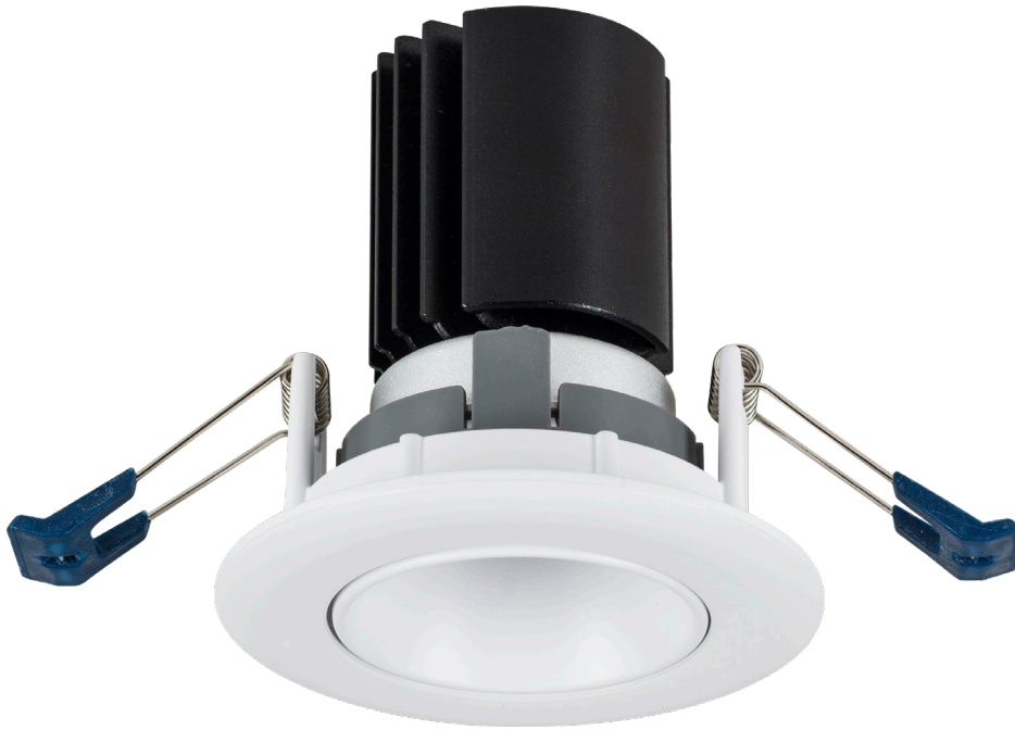
LED Star White