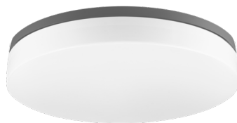
300 x 300