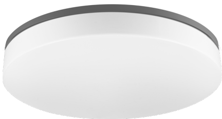
600 x 600