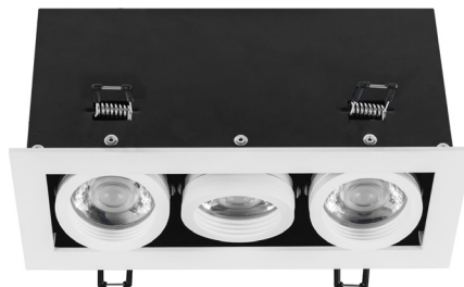
Triple Lens Option