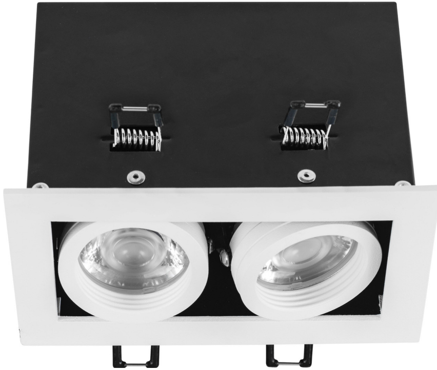
Double Lens Option