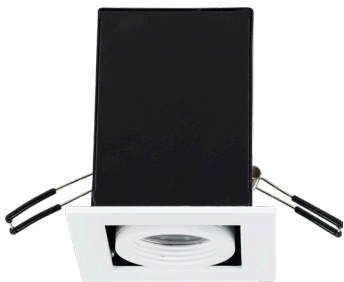
Single Lens Option