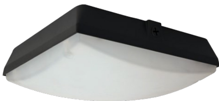
Larger 315mm Size