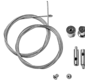
3m Wire suspension kit