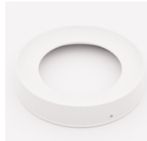
RAL9005 Black Snoot