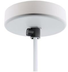
Decorative Ceiling Rose