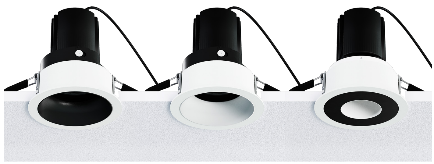
FLEX-STAR BLACK REFLECTOR, WHITE REFLECTOR, PIN SPOT.