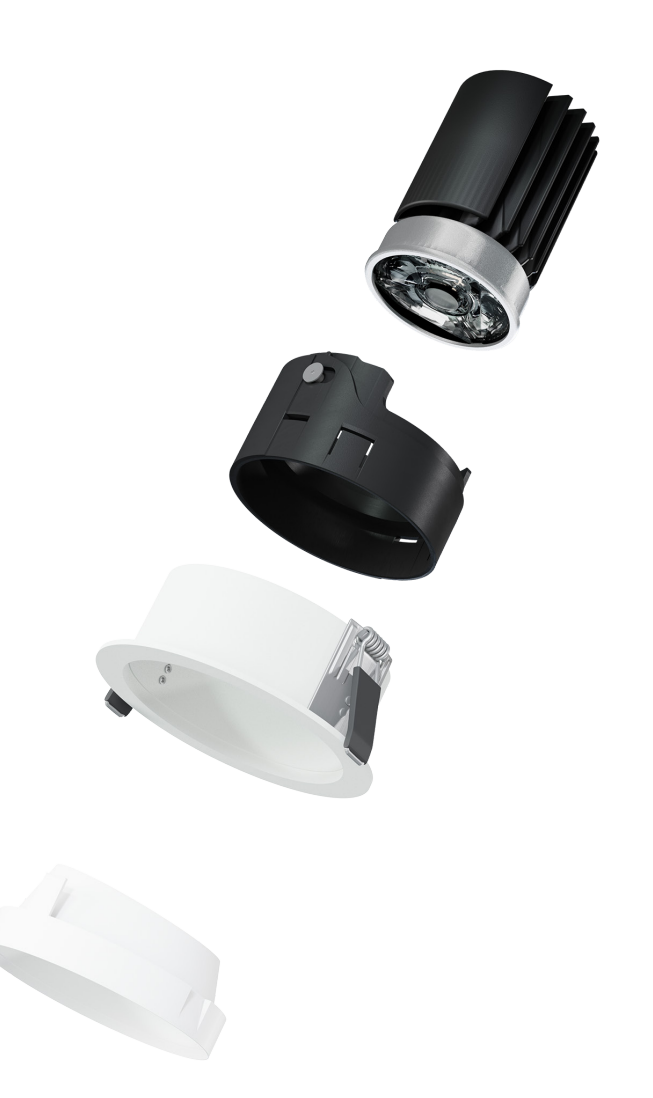
FLEX-STAR EXPLODED VIEW.