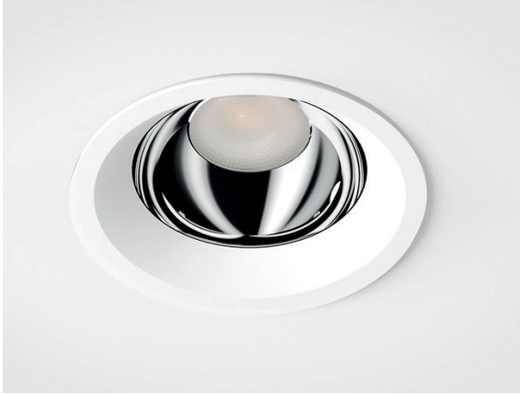
White Bezel & Specular Reflector