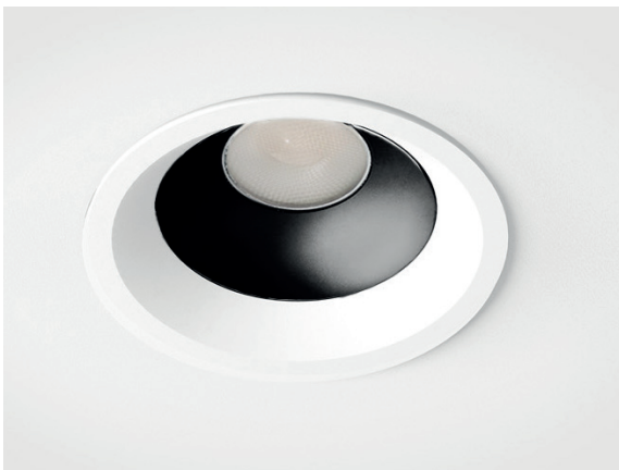
White Bezel & Black Reflector