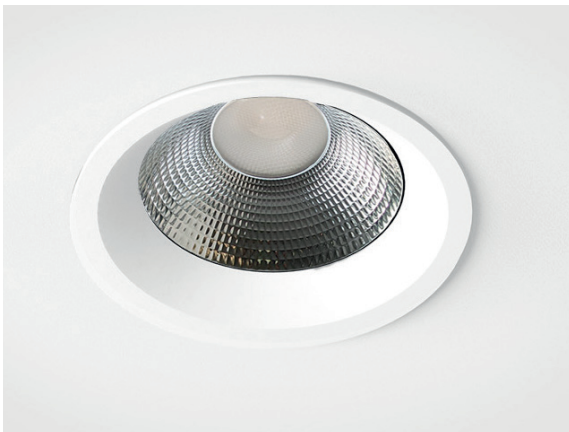
White Bezel & Faceted Reflector