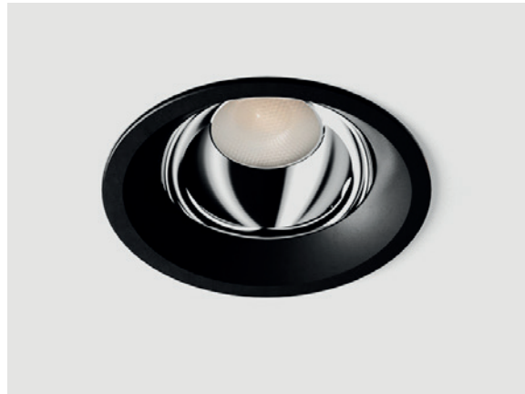
Black bezel & Specular Reflector