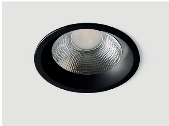
Black Bezel & Faceted Reflector